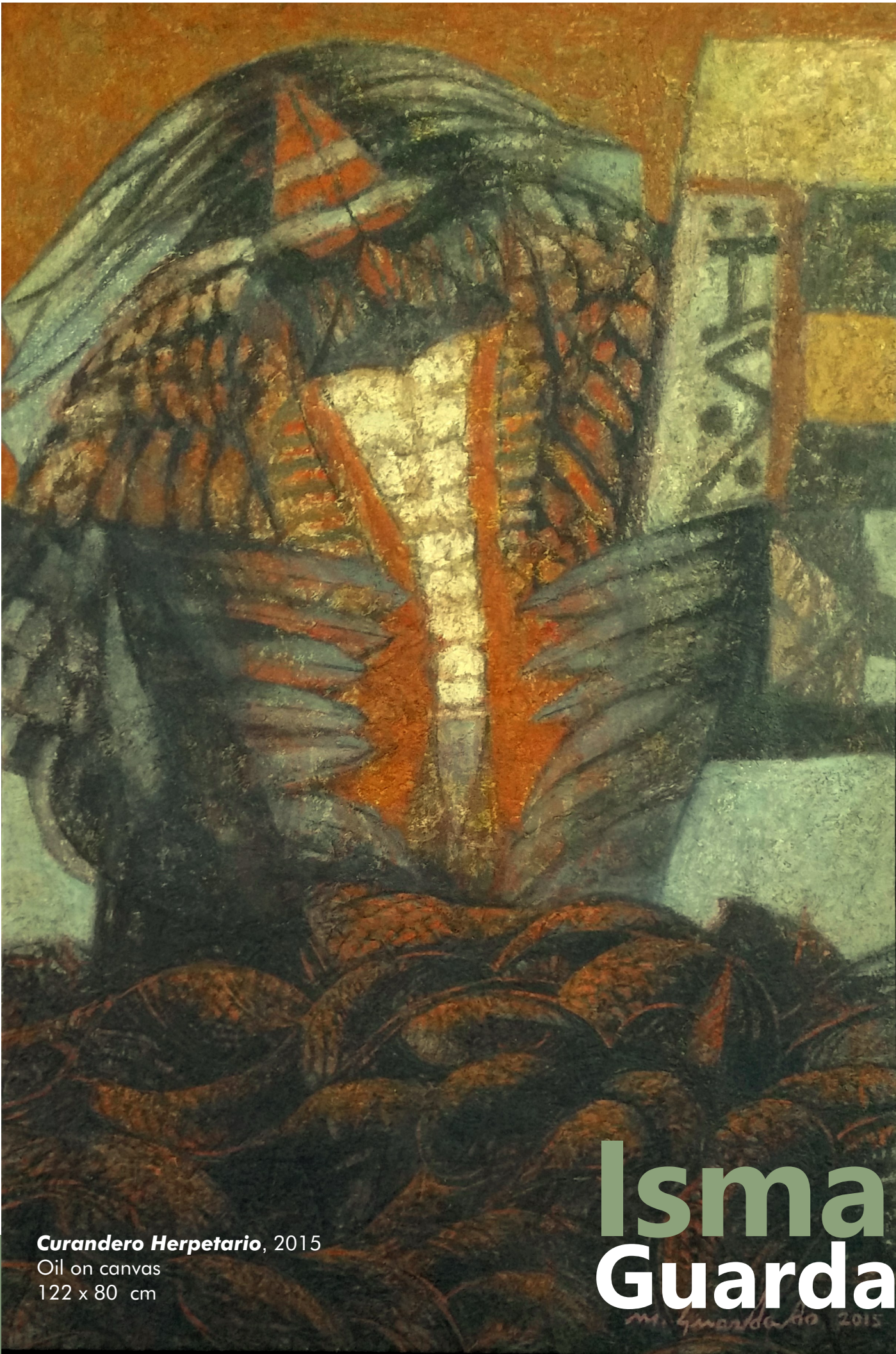
Curandero Herpetario , 2015 Oil on canvas 122 x 80 cm