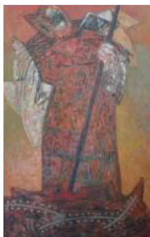
Lancero , 2020, oil on canvas, 80 x 80 cm