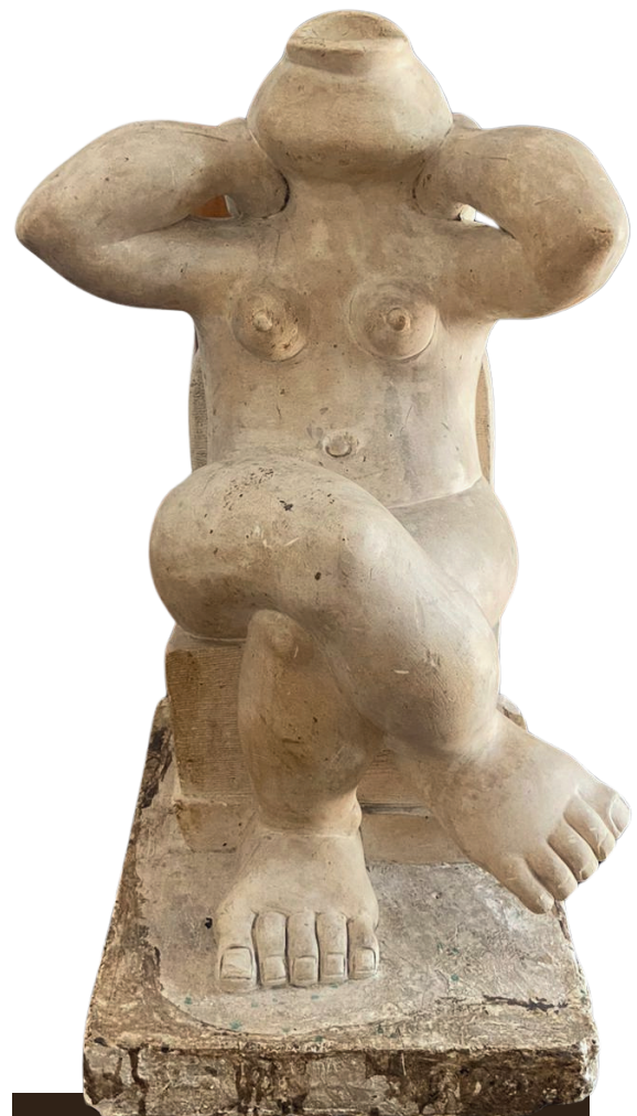
Rain drinker 1960 - 1972