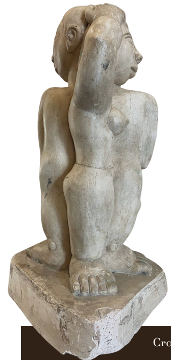
Crossed couple Ca. 1960