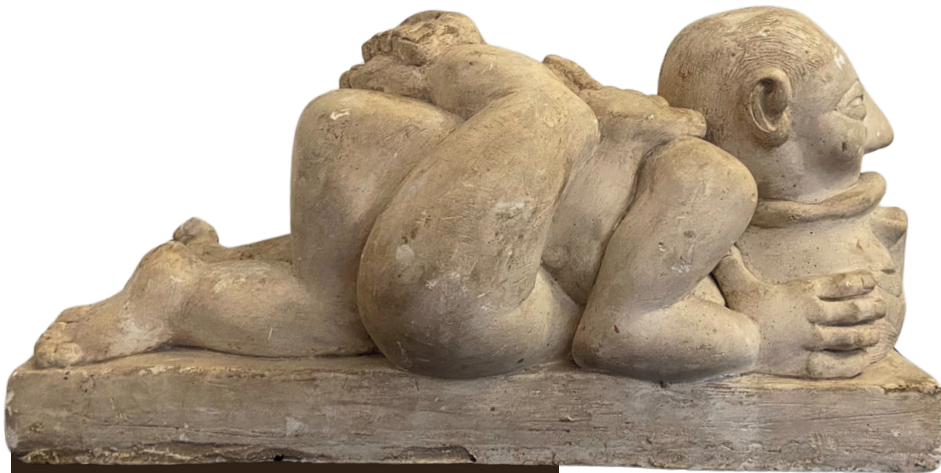
Coupling 1960 - 1972