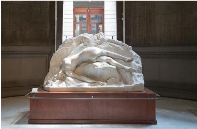
Après l'Orgie 1909, Marble