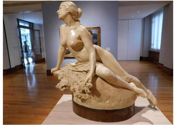
Ariadna Abandonada (Abandoned Ariadna) 1898, patinated plaster